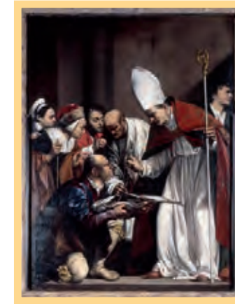
The Fish Miracle of Benno of Meissen, by Carlo Saraceni in the church Santa Maria dell'Anima in Rome, 1618

— For the first time ever, an innovative exhibition presents the symbol-laden role that Bishop Benno of Meissen and his canonization played in the past centuries. The works and symbolic power of the figure of Benno have exuded radiance up to the present day. The memory of him is a treasure which is worth more than just gold or silver. Sculptures, paintings, priestly garments and gorgeous handwritings on display in the authentic place tell stories of glamor, faith and power. Both innovative media and