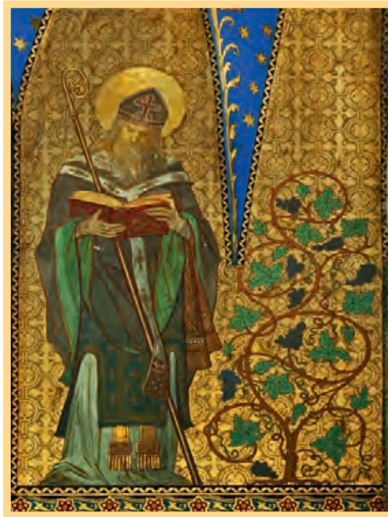
Stylized depiction of Bishop Benno of Meissen, mural, Meissen Albrechtsburg Castle, 19th century