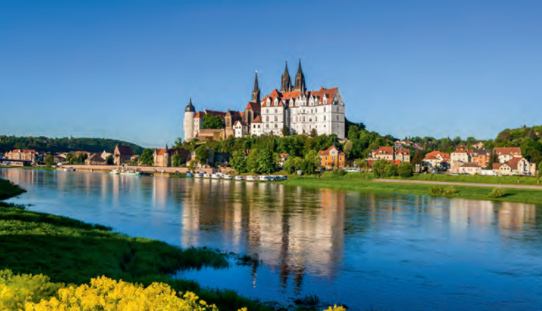
Meissen Albrechtsburg Castle